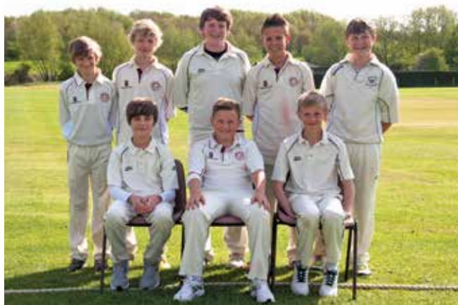
Last season's Under 14s team