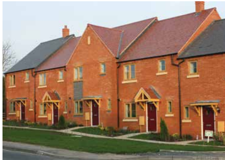
The above houses are from one of a number of new housing developments since 2005

Town Councillor and Neighbourhood Plan representative, Ian Cooper, said: "It's wonderful to see such a positive response to living in Shipston. The reduced demand for housing in general is perhaps not surprising given the amount of development we have seen since 2005, but clearly we still