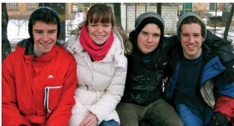
Youngsters on a mission in Moldova

Stour Valley Baptist Church and the Joint Churches of Shipston Youth Project run a variety of Youth Groups. To find out more please visit SVBC's website www.stourvalleybaptist.org.uk